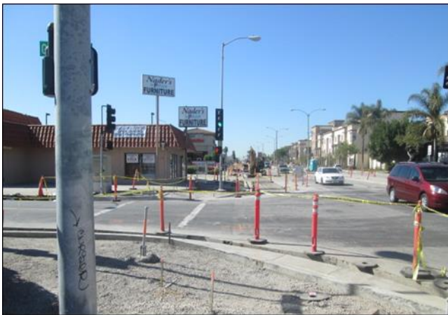
Ready For PCC at Grace