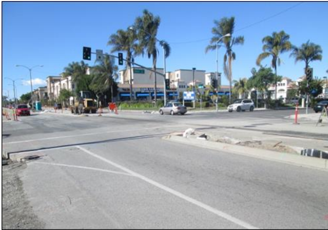
Grace Intersection has Temp. Paving on Trench