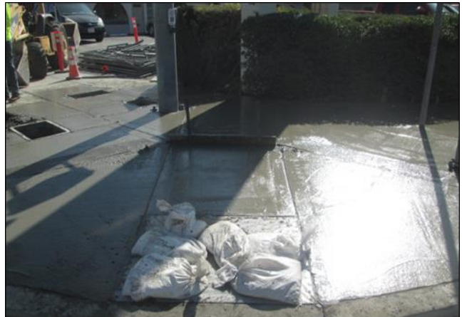
ADA Ramp and Sidewalk at Grace