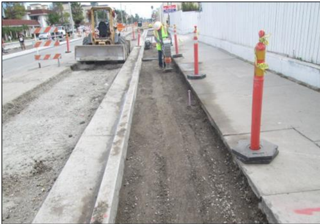
SW Base Being Compacted