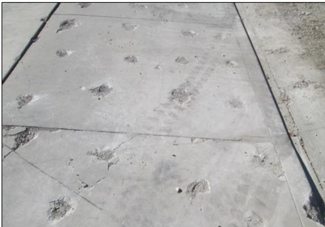
Typical DW Ready for Removal