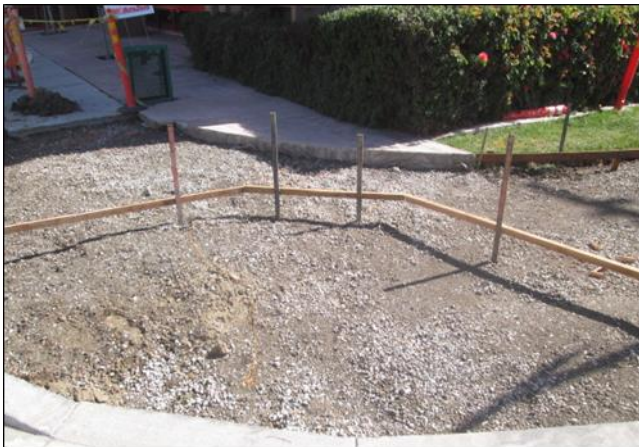
ADA Curb Ramp to be Formed and Placed