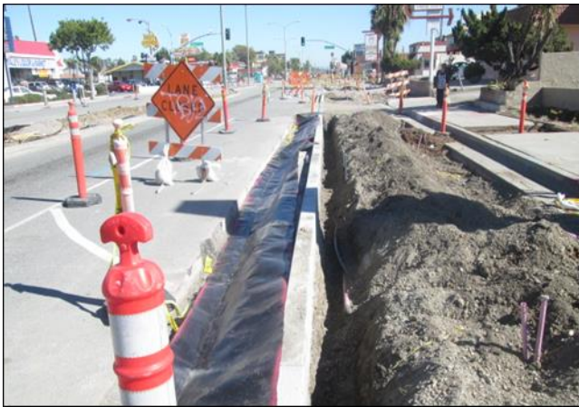
Water Proofing Material Ready to Install