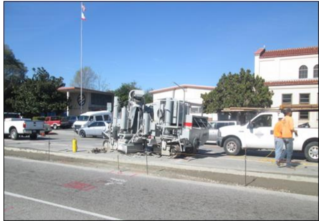
Curb Machine at Medium