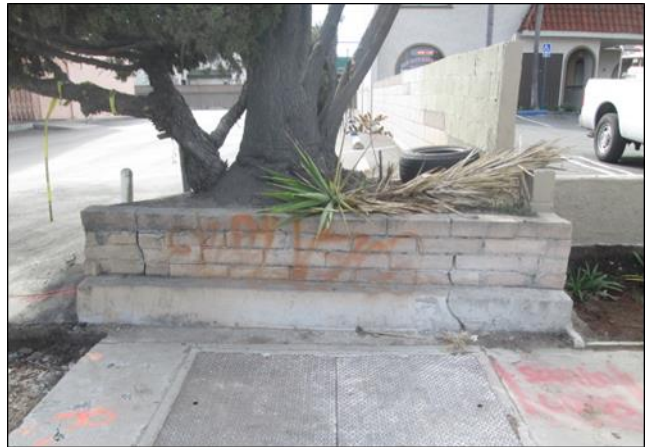
SW to be Removed