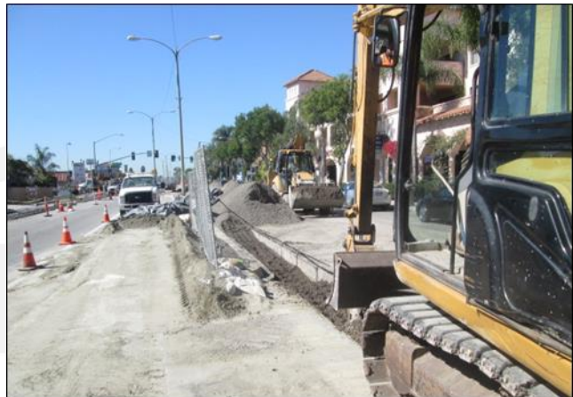
BH Using Sheep's Foot Compacting WL Trench