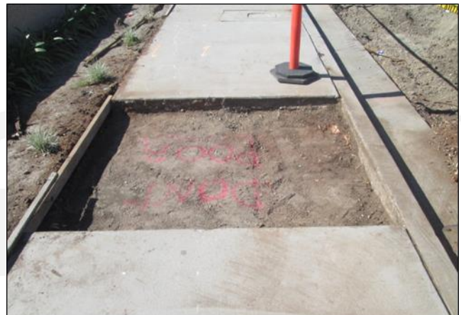
Tree Well Pave Back