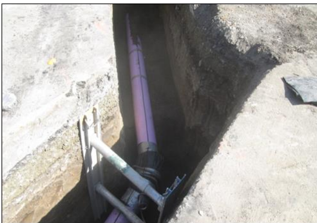
Change in Grade