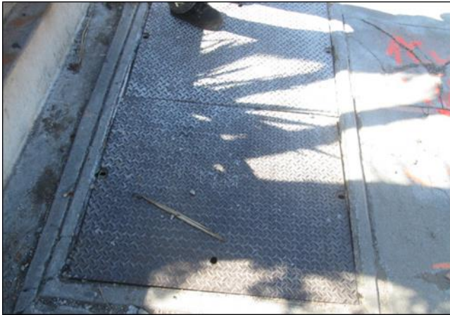
ATT Box Unsecured