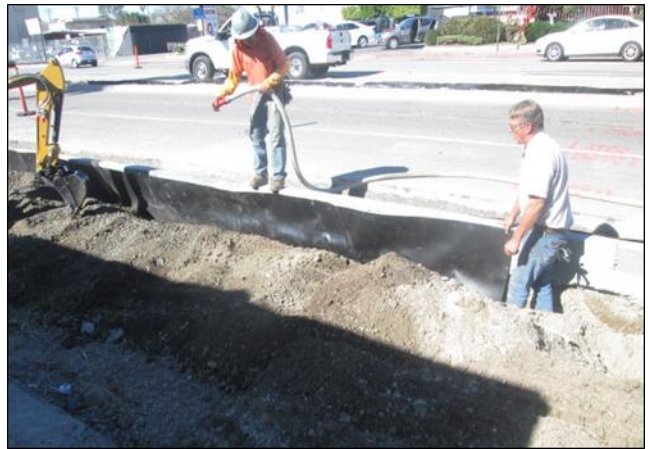
Installing Curb Water Proofing Material