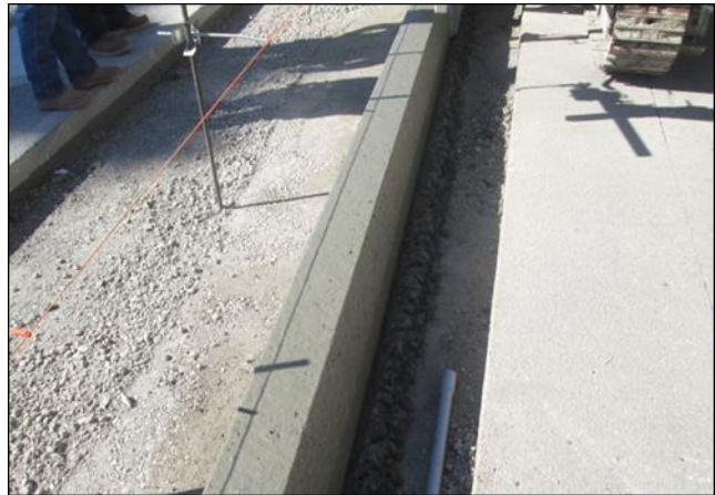
Freshly Placed Curb at Station