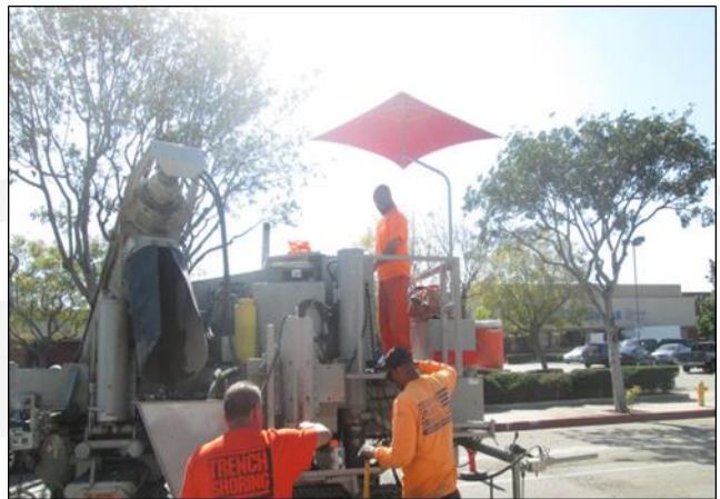
Curb Machine Placing 6" Median Curb East Bound