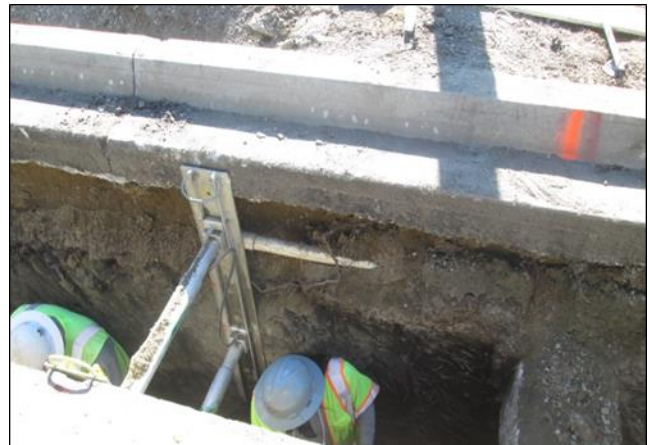
Earthen Trench Wall Giving Away as it Dries Out