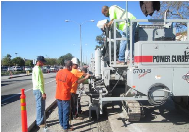
Setting Up the Curb Machine