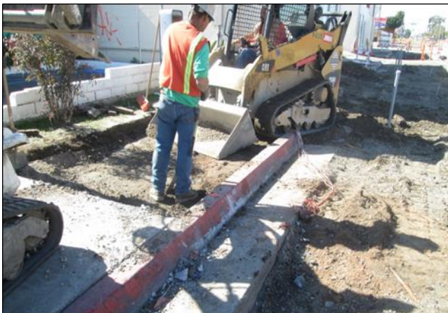
Sidewalk Removal West Of Ravenna