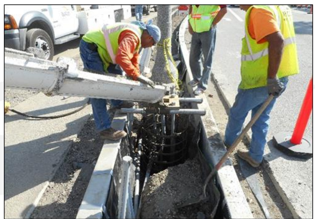
Street Light Foundation PCC Being Poured