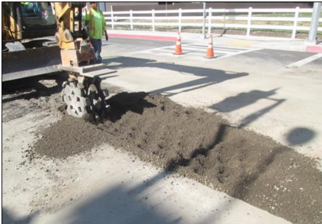
Compaction at Blow off Location