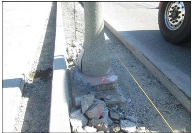
Proximity of Curb to Exist SL Foundation