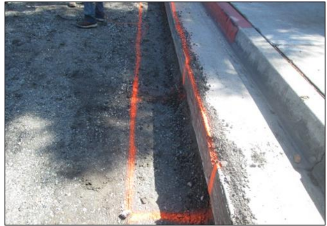
Layout for New Curb and Gutter Placement