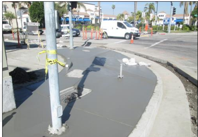
PCC Placed for ADA Curb Ramp and SW Radius