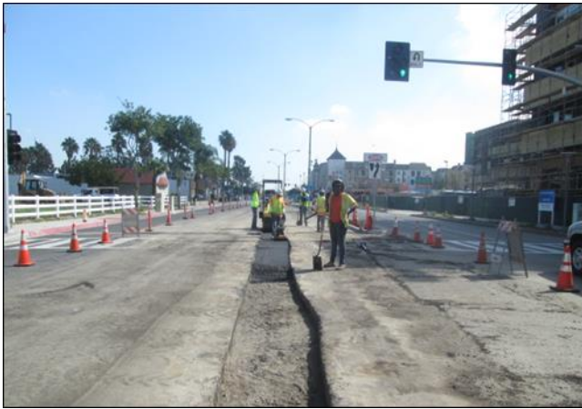
Recycled Water Line Being Covered by PCC