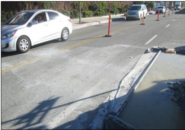
Street Light Foundation Placed