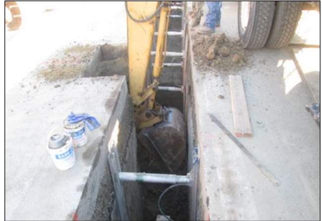
Excavating Water Line for "Blow Off"