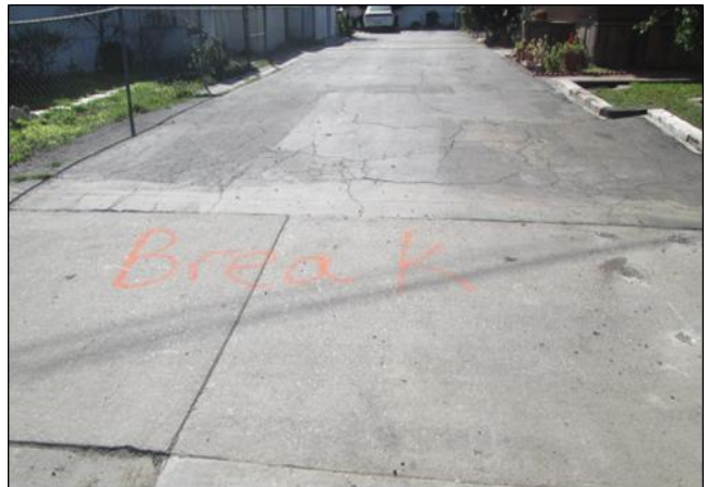
Driveway to Be Removed