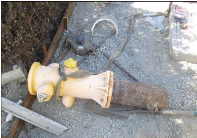
Exist FH at Grace Being Replaced