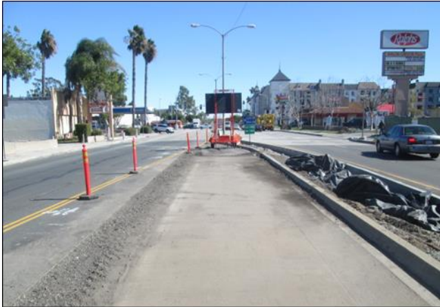
Trench Ready to Be Excavated