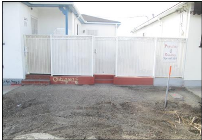
Base Placed for Auto Body DW