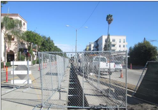
Trench East Of Grace Ready for Pipe